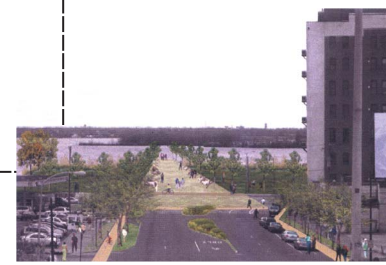
4. SPRING GARDEN TERMINUS. Parking transformed to park, at the terminus of one of the city's great boulevards. The river brought closer to the intersection of two avenues. A green link to the EI.