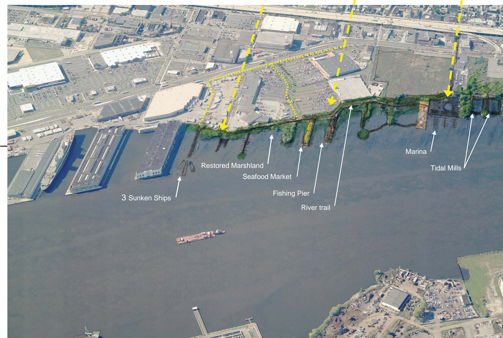
3. CALLOWHILL DOCKS. The heritage of Old City reconnected to the only surviving piece of the original waterfront, at a juncture with the regional highway system.