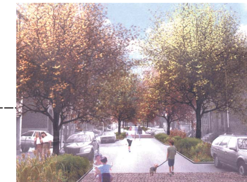
5. PENN TREATY POWER HOUSE. The two histories of Philadelphia—colonial and industrial—re-connected to the present life of the city.