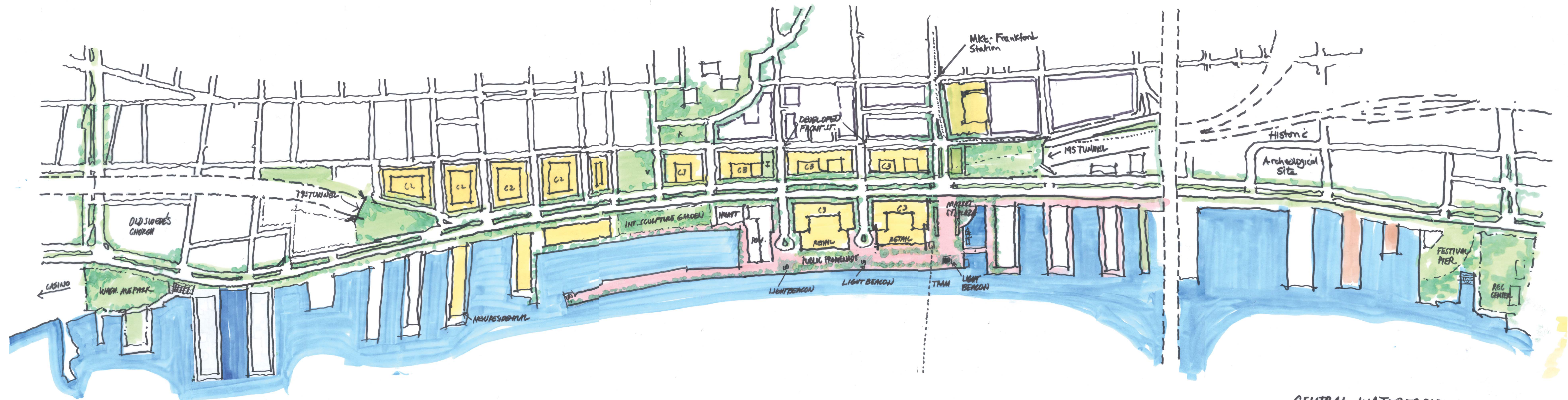
CENTRAL WATERFRONT 1" = 200' North →