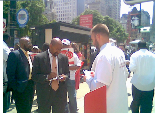
Michael Nutter votes at Philly's Ballot Box on Election Day. He votes "YES" for the 1,500-foot buffer.

I have spoken out in support of the referendum. I have not put forth any policy plans that rely on casino revenues.