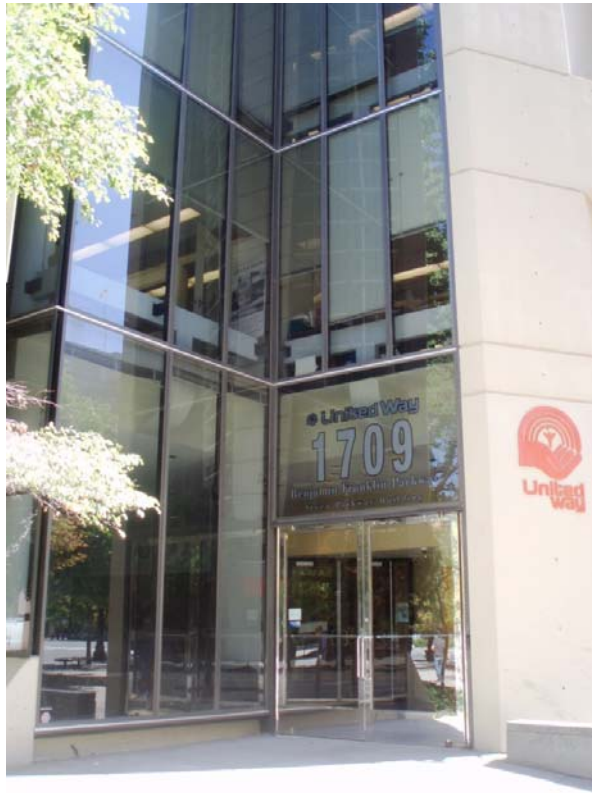
Figure 9: Entrance detail (September 2010)