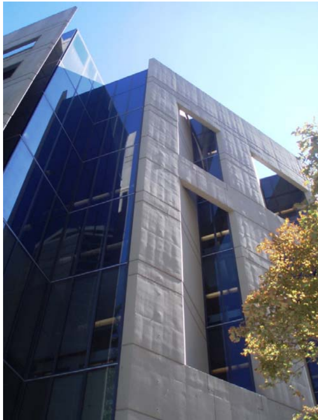
Figure 6: South elevation detail (September 2010)