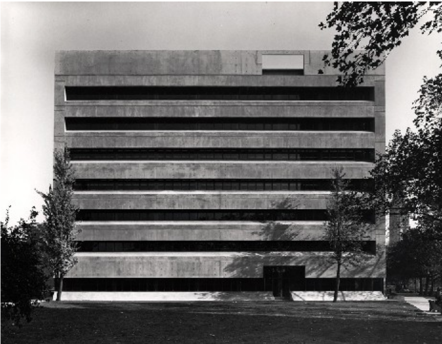
Figure 2: West Elevation, c.1971