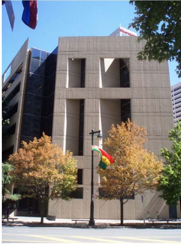
Figure 3: South elevation (September 2010)