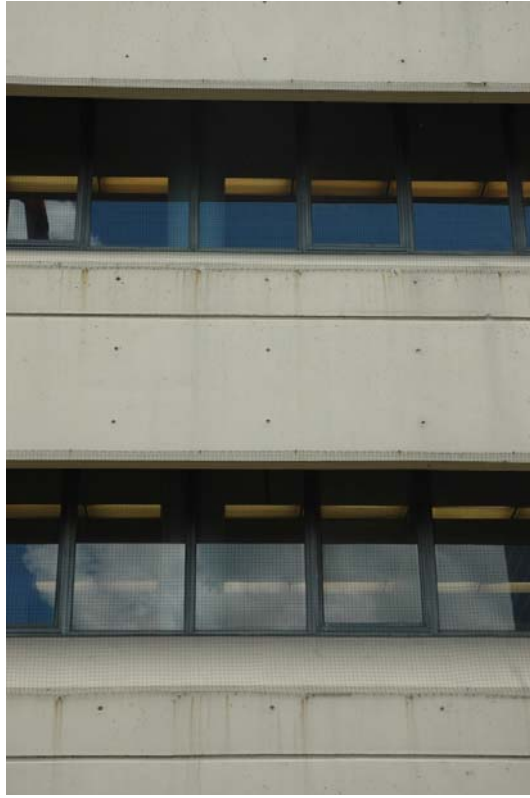
Figure 7: West elevation detail (September 2010)