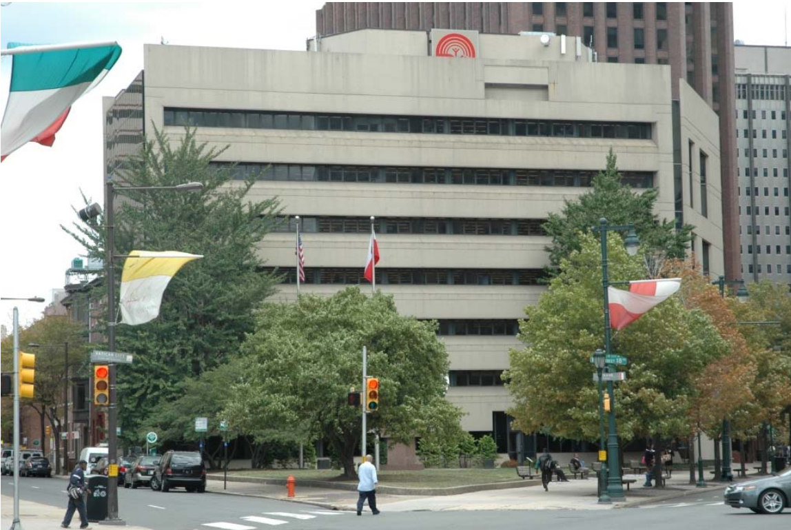
Figure 1: United Fund Building as viewed from the northeast (September 2010)