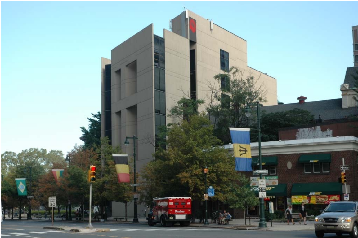
Figure 5: South and east elevations (September 2010)