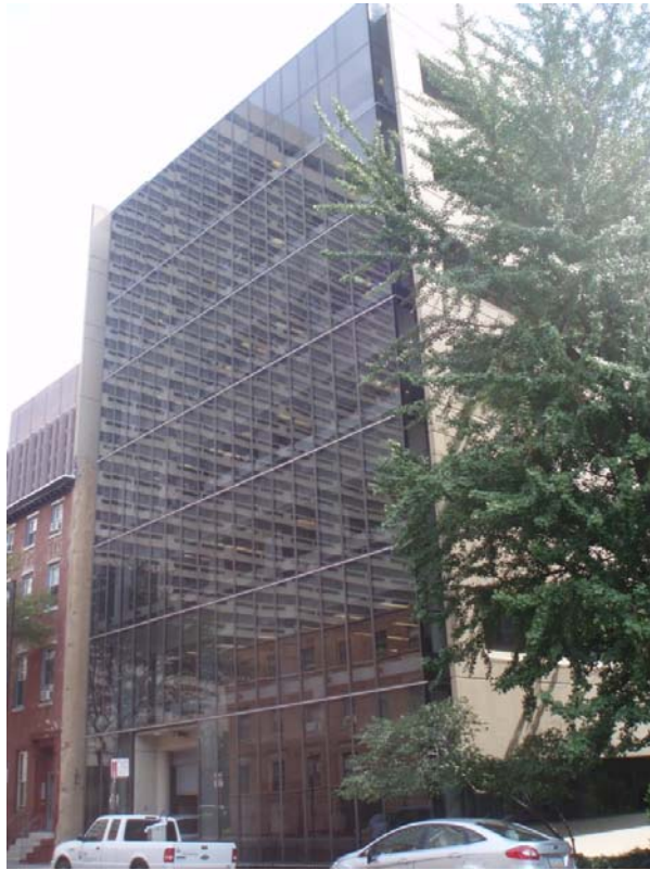
Figure 4: North elevation (September 2010)