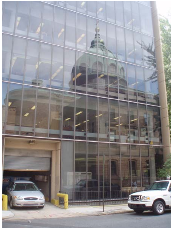
Figure 10: North elevation detail (September 2010)