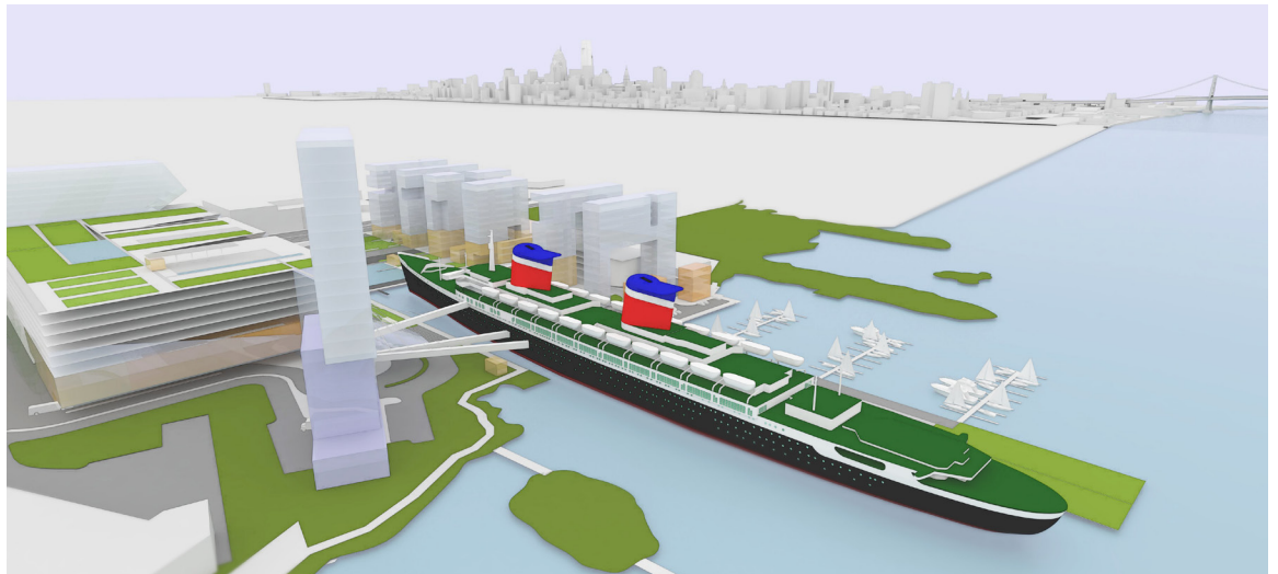
Top: View from Columbus Boulevard Above: View looking Northwest

We feel strongly that access to the waterfront can and should be a visible and integral part of the proposal. The SS United States is the keystone that completes that larger idea. It is exciting to be able to combine a national maritime treasure, sound business opportunities for the casino and other development, and a vibrant public space at the waterfront in keeping with the guidelines prepared by Penn Praxis in their Civic Vision for the Central Delaware.